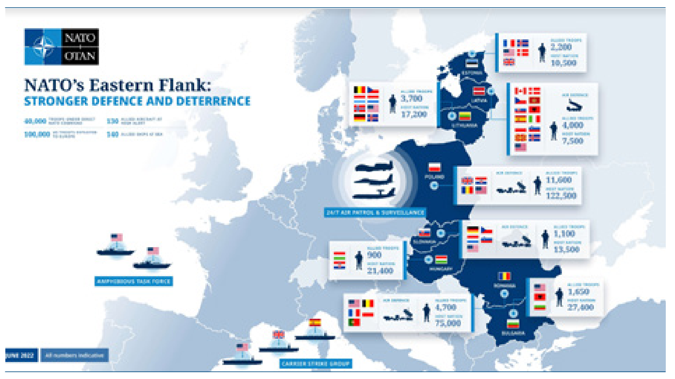
Figure 5 | NATO's Eastern Flank: Stronger Defense and Deterrence Map (July 2022)