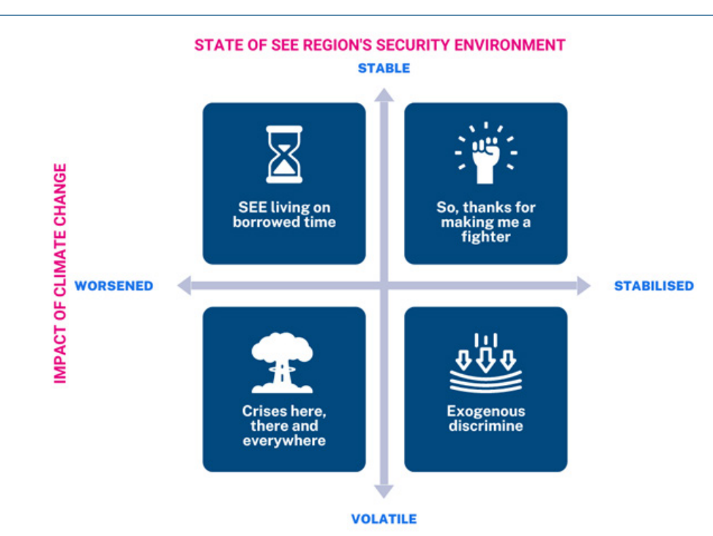
Figure 6 | Scenario Matrix for the SEE region: climate change & security

Presented below are brief narrative overviews and policy implications of four distinct scenarios framed by a 2x2 matrix. The vertical axis represents the state of the regional security environment in Southeastern Europe, while the horizontal axis depicts the progression of climate change and its impact on countries, economies and communities in the SEE region. All four scenarios incorporate mid-term (by 2030) and long-term (by 2050) operationalization of these two drivers and their specific manifestations. The mid-term security dimension is dominated by the region's direct proximity to the war in Ukraine and the growing concerns for spill over of conflict and instability. In the 2050 horizon, regional security is examined through the lens of global geopolitical confrontation between the United States and China, or more broadly between liberal democracies and illiberal regimes. As Southeastern Europe has historically been a gateway and a bridge between the "East" and the "West", it is important to reflect on it as a potential contact point for confrontation. When discussing the impact of climate change, the midterm perspective tackles supply chain resilience with an emphasis on energy security. The longer timeframe of 2050 though embodies the notions of climate change adaptation and mitigation.